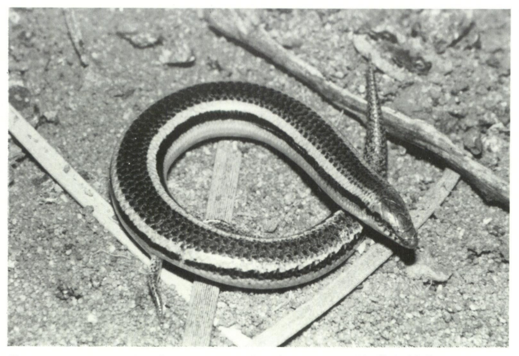
Figure 3 A Lerista kendricki from 16 km SSW Hamelin, photographed in life by M. Peterson.

and interparietal fused. Supraoculars 3, first two in contact with frontal. Supraciliaries normally 4, last much the smallest (in one specimen second and third fused to each other, in another third and fourth fused to third supraocular, in another fourth divided). Loreals 2, second not fused to prefrontal. Presuboculars 2. Upper labials 6. Nuchals 1 (N 11), 2 (19) or 3 (1). Midbody scale rows 20 (N 5). Lamellae under longer toe 11-15 (N 25, mean 11.6), rarely with a weak keel.