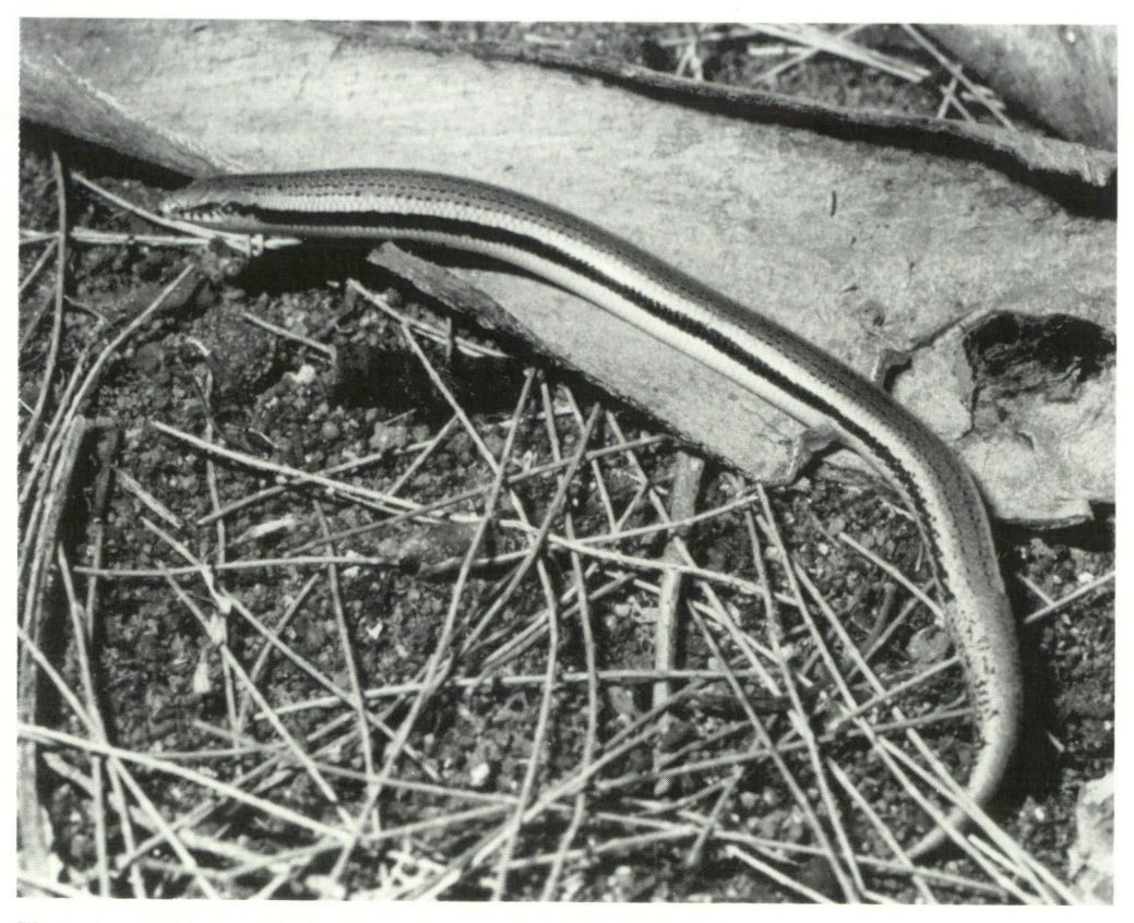
Figure 4 Holotype of Lerista yuna photographed in life by R.E. Johnstone.